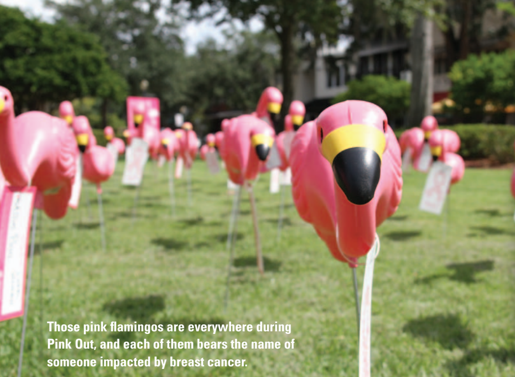
Those pink flamingos are everywhere during Pink Out, and each of them bears the name of someone impacted by breast cancer.